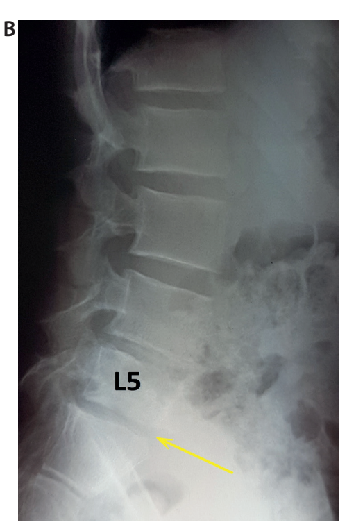
FIGURE 1. A) A lumbosacral X-ray study in the lateral projection shows narrowing of the L4/L5 and L5/S1 (red arrow) intervertebral spaces. B) A study performed a few months later displays progression of the latter (yellow arrow)

of the tumour presented distortion, and the skin above was tender. A neurological examination revealed positive tension signs of the left lower limb.