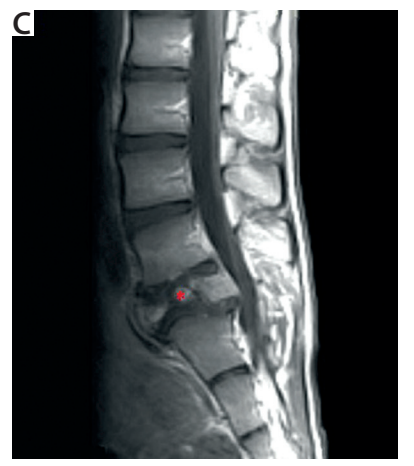
FIGURE 2. A bone window CT study in sagittal reformat (A) shows a narrowed L5 vertebra (asterisk) with osteolytic change, extending to the spinal canal. A T1-weighted imaging MRI study before (B) and after (C) gadolinium administration presents a hypointense L5 lesion (asterisk) with post-contrast enhancement